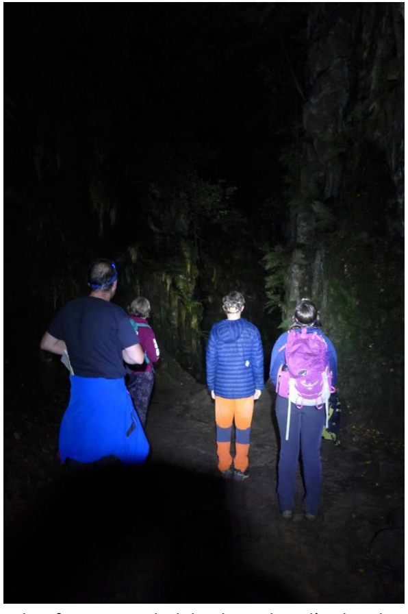
Another fantastic night hike through Lud's Church