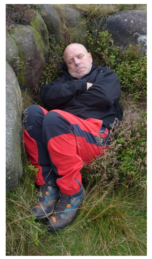
Stumpy smashing "40 winks"