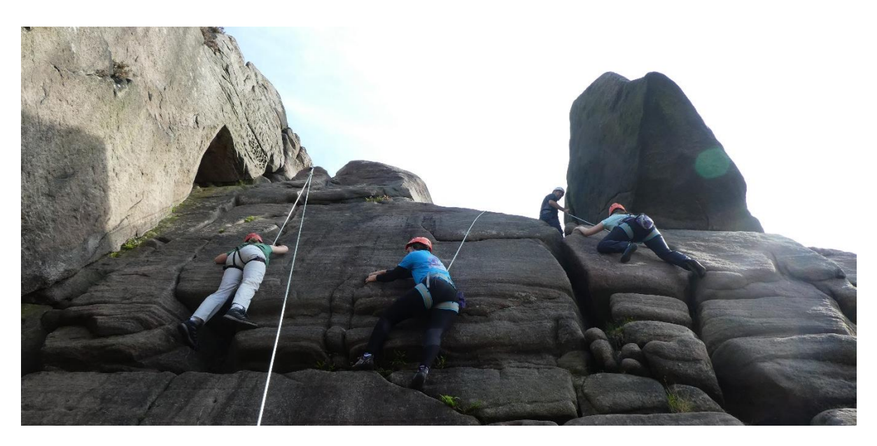
Playing around on Prow corner and cracks